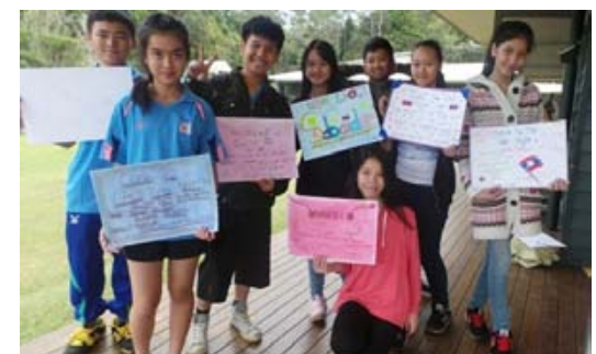
Posters for Cafe Night