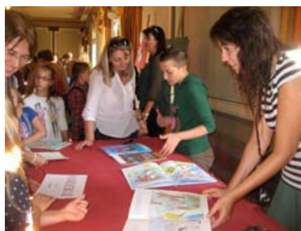
Volunteers giving individual consultations