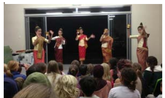
Lao Students Performing at Cafe Night