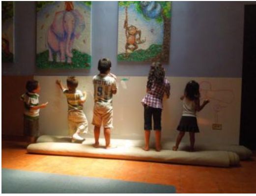
I Love Painting