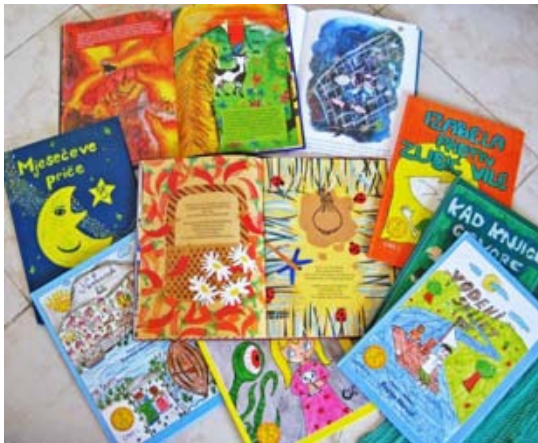
The printed stories

The 10th Contest was announced with a deadline in March 2014.