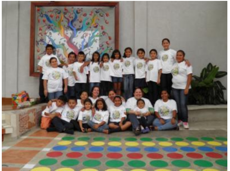
Under the Wisdom Tree

In 2008, WWDF (Women's Welfare Department Foundation) Costa Rica began to work in La Carpio, a marginal community in the outskirts of San Jose. It has an area of just 0.6 sq.km and approximately