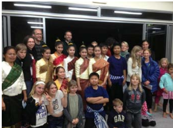
Students with Host Families

lovely teachers, who have spent the month with us.