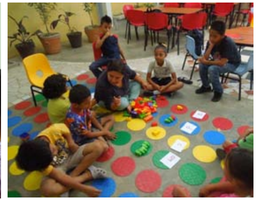
Play and Learn