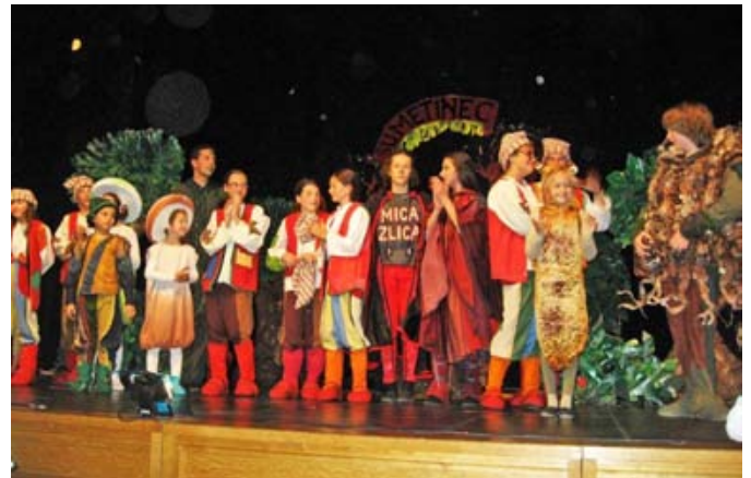
The young performers